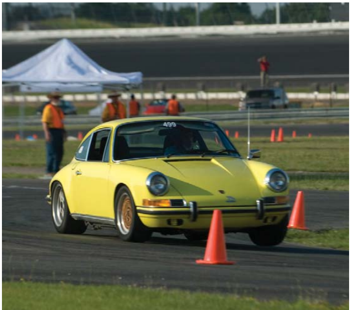
A faculty member racing his Porsche and going so fast that the inside front wheel is not on the ground.