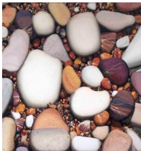
© George Dombek, Together in Time and Space , 2002, watercolor on paper. Courtesy of the artist.

Visit www.uca.edu/art/baum/membership and complete and fax the form to 501.450.3670 or call the gallery office @ 501.450.5793!