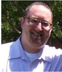
Justin Long (2007). University of Southern Mississippi

(see his article in the book: How to Survive Your Freshman Year )