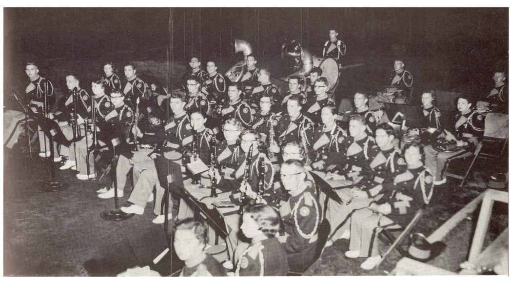
Join Your Classmates: The Year of The "6"

We hope that you and others will enjoy the Homecoming Brunch and will join us at the tailgate for the UCA Band and Alumni Band.